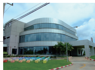
Nippon Paint (Thailand)