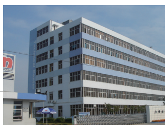
Nippon Paint (China)

Nippon Paint was reorganized as a holding company. The cooperation with Wuthelam was further deepened. Acquired NIPSEA business excluding India and Indonesia as consolidated subsidiaries, and made a third-party allotment of 60 million shares to Wuthelam. Became the No. 1 paint manufacturer in Asia and No. 4 in the world.