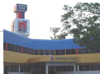
Nippon Paint (Singapore)

Operations were expanded into the US, the UK, and the Philippines.