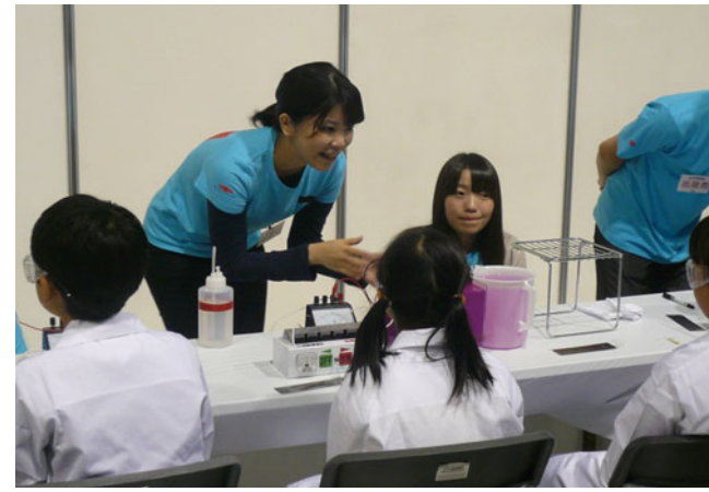
Explaining the experiment process to children

Nearly 40 volunteer staff from Nippon Paint Group participated in the show, conducting demonstrations to teach approximately 300 children and their caretakers over the course of two days about electric paint coloring. The children enjoyed the event and showed enthusiasm to come again next year, with the caretakers listening attentively to our explanations.