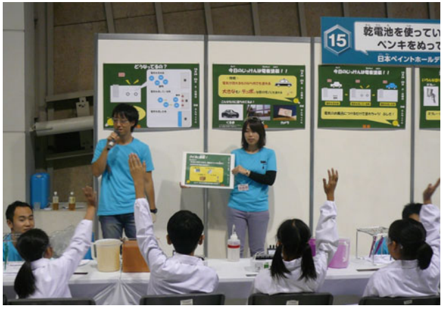
Explaining the principles of electric paint to children